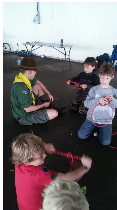
SCOUTS BEING CRAFTY BY THE RIVER December 2016

The Otters and Timberwolves went to the Crescent Park to have some fun despite the cold rain for our last meeting before winter break. After singing a song about bugs to learn their anatomy, they made some great insect models. Next we practiced our square knots in order to play a tug boat game. Lastly we looked at our collections and our house drawings we both did at home.