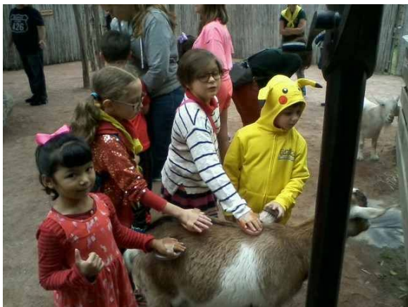
WILD SCOUTY TIMES AT THE ZOO! November 2016

The Scouts had a great time at the zoo. They got to pet the animals, see a sea lion show, and have a lot of free play on Monkey Hill. Many thanks to our Audubon Zoo tour guide for showing us around and allowing us a chance to feed the otters. We got to learn so much about how different and exciting animals can be.