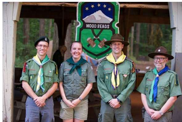
WOODBeads 2016 TRAINED! September 2016

The Scouts had a great first meeting of the year. We made some new necker slides by tooling our names in leather. We also did some drawing and played a memory/action card game with scout themes to get us back into the groove. Lastly we had some fun free play in the park.