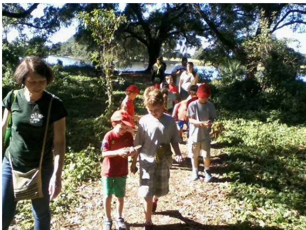
SCOUTS BEING CRAFTY IN THE FOREST October 2016

Our website has prior newsletters, how to register, and links to all our forms. We also have a google drive that has safety information, your Scout's badge chart, and the snack sign-up list.