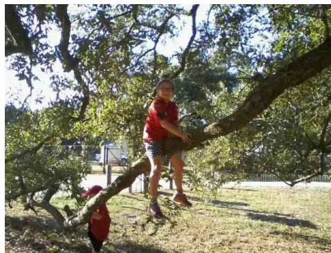
ARRGH! SCOUT PIRATE TREASURE BOXES November 2016

Flags in scouting are important for group spirit and so that we can find each other in a crowded park. We made a makeshift flag once for a campout and it worked great. We are looking for a family to help with creating a flag or a plan for the Group to make one. Please call William or Kyle with ideas.