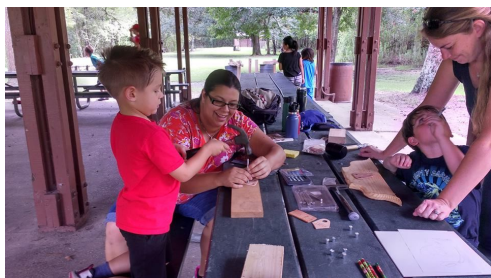
FIRST MEETING BACK September 2016

The Scouts had a great first meeting of the year. We made some new necker slides by tooling our names in leather. We also did some drawing and played a memory/action card game with scout themes to get us back into the groove. Lastly we had some fun free play in the park.