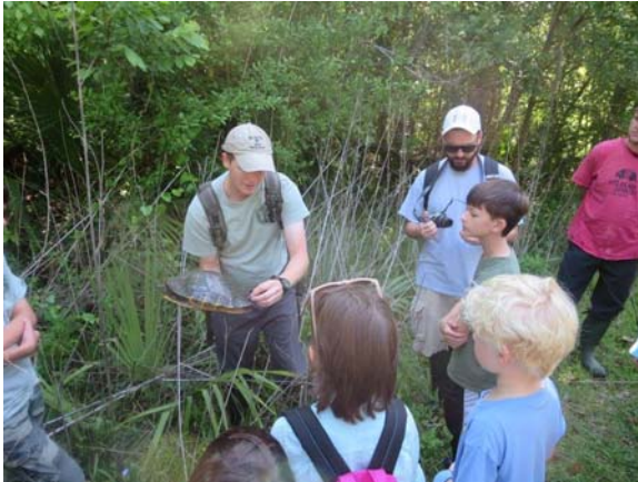
REPTILE FIELD TRIP May 2, 2015