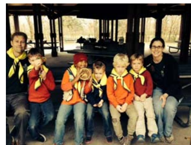
Welcome new Otters and Chipmunk!