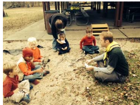
December 7, St. Bernard State Park Discussing "What is a Scout?" before our Investiture Ceremony