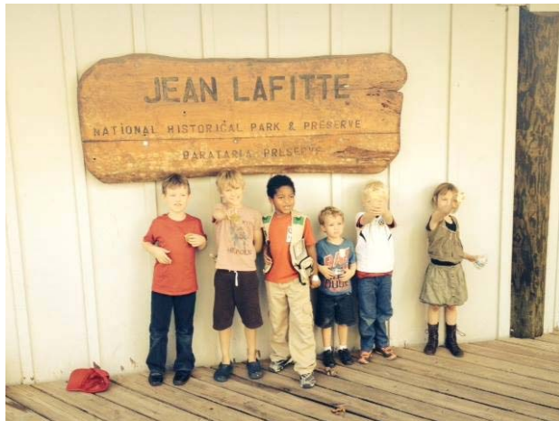
October 26, Barataria Preserve Learning about being a Junior Park Ranger

The Brownsea Training Camp (BTC) is where adults learn basic Scout Craft, child safety, and organizational policies. The Jackson, MS group will be hosting one this year. This is a great program to not only learn how to led a Scout Group, but also a great first step to help you to be better prepared for whatever happens in life.