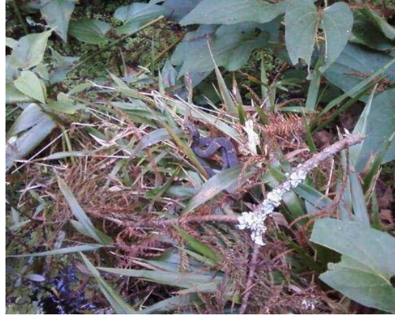
One of the many beautiful animals the Scouts have observed on our outings

This is our Scouting Group. It is led, supported, and staffed by volunteers. We know that parents and children have busy schedules, but if we communicate well and share the tasks we will all have fun. If you ever have any questions or comments, please contact us in person, by email, web site, or via Facebook (see addresses at the bottom of the page).