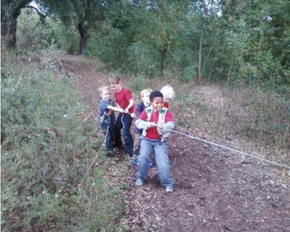
November 22, Couterie Forest Playing Tug-of-War with pieces of rope tied together with square knots