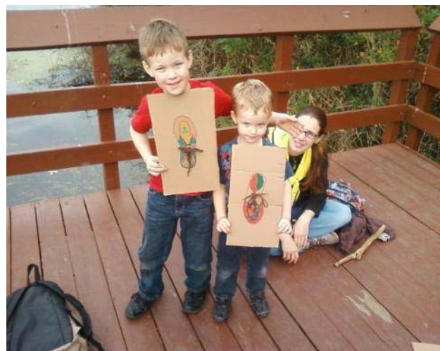
November 22, Couterie Forest Learning how to tie shoelaces.

Otters' shirts are red, Timberwolves are grey, and Rovers/Adults are forest green. Adults may either wear the official green BPSA logo t-shirt or the button-down Rover shirt. Purchase your hat and t-shirt either at a local store such as Wal-Mart, Michaels's, or JoAnn's. The BPSA Quartermaster store has them as well but long-sleeve is hot and their hats run small: http://baden-powell-service-assoc-quartermasters.myshopify.com/ .