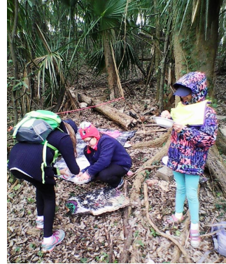
SCOUTY WINTER MEETING January 2019

This is our Scouting Group. It is led, planned, and supported by us. A Traditional Scout Group does not have paid staff. We know that adults and children have busy schedules, but if we communicate well and share the tasks we will all have fun.