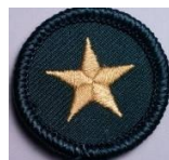
2 nd Star